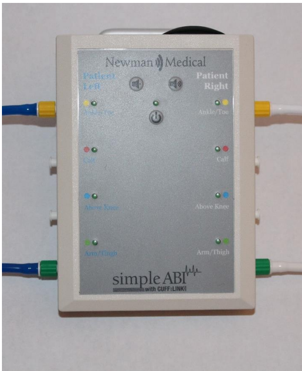
Cuff-Link Control Unit with tubing properly attached