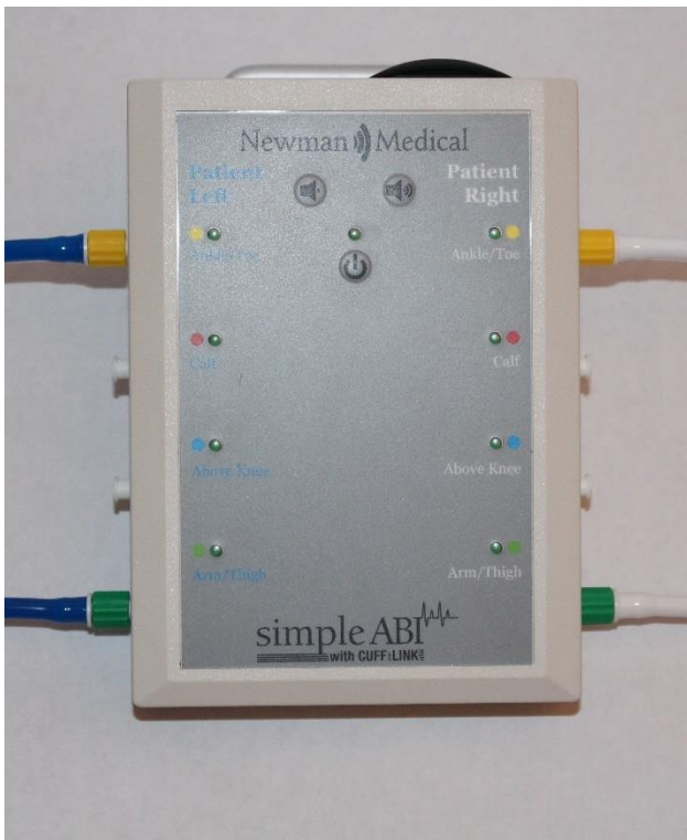
Cuff-Link Control Unit with tubing properly attached